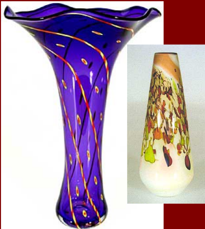
Art Glass by Colleen Ott